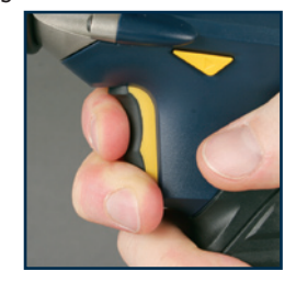
Note. You can only change the direction of rotation of the

drill using the forward/reverse switch when the trigger is NOT depressed.